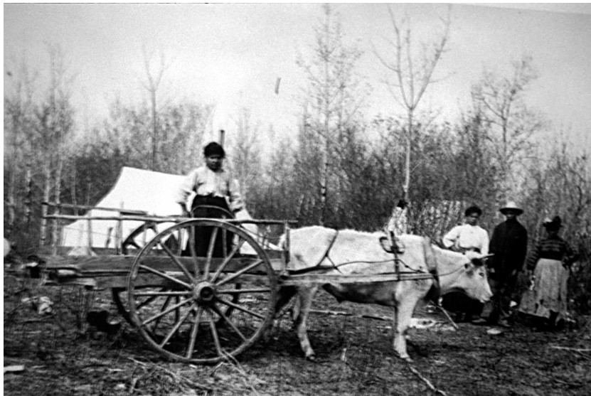
Metis family with cart at Turtle Mountain, North Dakota.

[Metis] caravans or trains have annually increased in number, and now two hundred carts make the yearly pilgrimage across the prairies, six hundred and fifty miles, to St. Paul...They are laden with buffalo hides, pemmican, peltries, fur, embroidered leather coats, moccasins, saddles, &c. these they sell or exchange in St. Paul and return again to their secluded home... 2