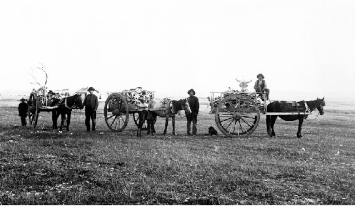
Metis buffalo bone pickers at Minnewaukan, Dakota Territory, May 24, 1886