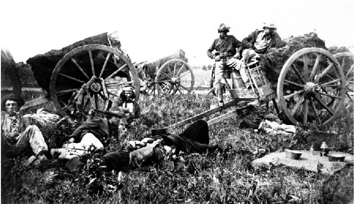
Red River Carts from Pembina camped on St. Anthony's Hill, 1858.

As the West developed, settlements sprang up far away from the river transportation routes. Red River carts, which had been used for years by the Metis, became the chief mode of land transport to service these otherwise unreachable communities. As the need for larger and stronger carts increased, they became more refined. A much lighter spoked wheel gradually replaced the solid wheel. Made in a dish shape, these new wheels did not sink as far into the earth, making them easier to pull. The rawhide (green shaganappi) which bound the entire cart together became as tough as steel when dry and so strong, it would support a 450-kilogram load. One drawback to the carts was the loud noise the carts made because of the screeching of wood rubbing against wood as the wheels turned on unlubricated axles. Grease could not be used because this would pick up dust and dirt, which would wear out the hub and axle in no time.